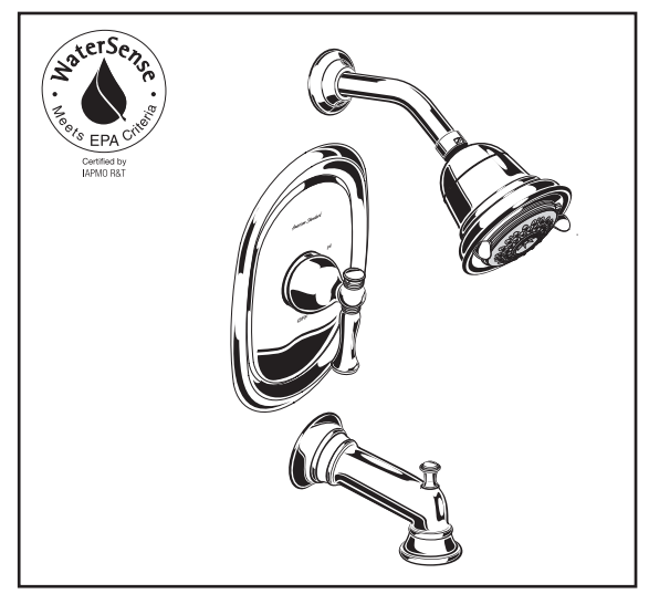
T440.508 Bath/Shower Trim Shown