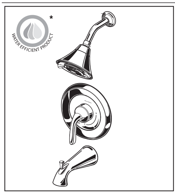
T186.508 Bath/Shower Trim Shown *WaterSense® approval pending