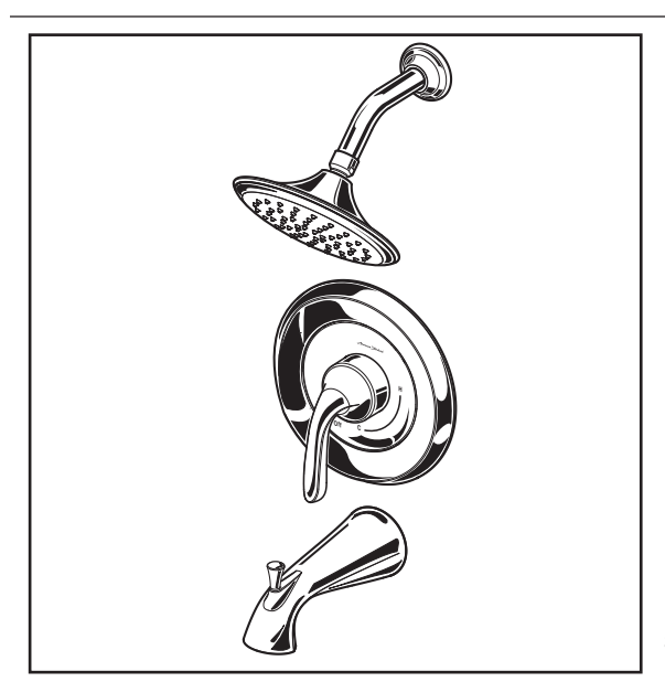
T186.502 Bath/Shower Trim Shown