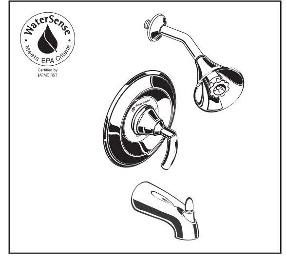
T038.508 Bath/Shower Trim Shown