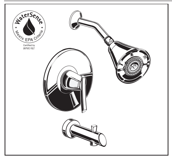
T010.508 Bath/Shower Trim Shown