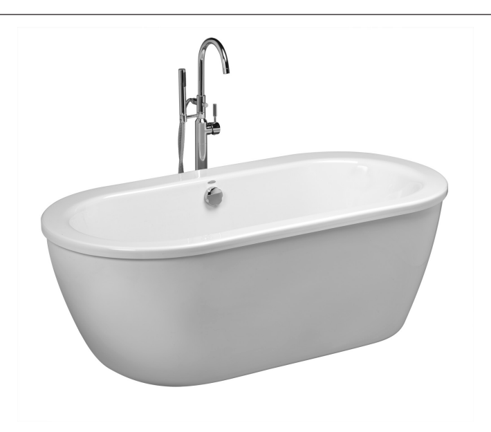
SEE REVERSE SIDE FOR ROUGHING-IN DIMENSIONS AND PRODUCT SPECIFICATIONS