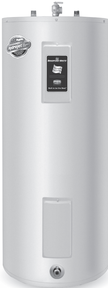
Photo is of RE250S6